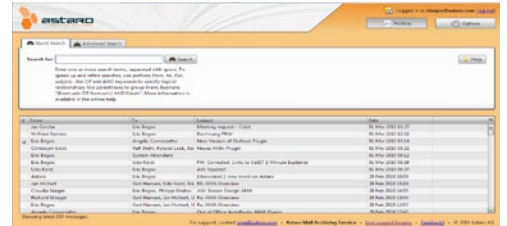
Find e-mails in seconds